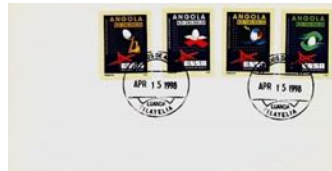
Luanda Philatelic Cancel 2008