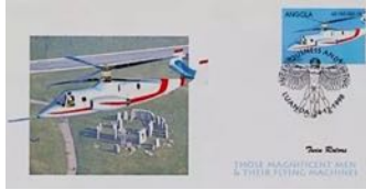
House of Questa 1995-2001.

A standard size FDC is available for the 2024 Carnation Revolution issue and the Cape Verde 50 th Independence issue.