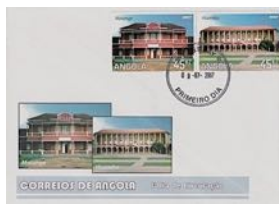
Stamperidja 2006 +