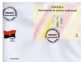
Correios de Angola 2006-11