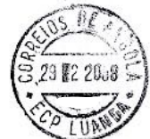
Type # 1