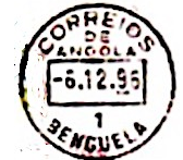
Type # 2