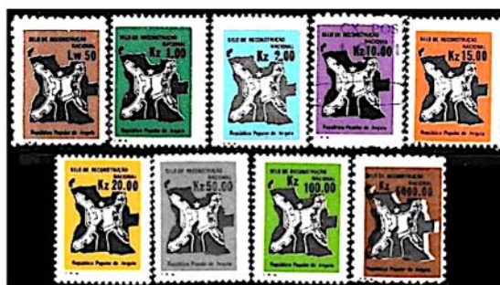
A short set of National Reconstruction stamps