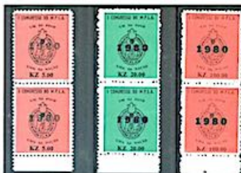
A full set of National Congress labels