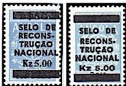
The two types of 5Kz overprint

This set of stamp labels was Issued for the 1st National Congress of the MPLA in Luanda. They come in three value, 5, 20, and 100Kz and were printed by INA, Luanda. They were fund-raising stamps, with the 5Kz stamp used on mail in a similar way to an Assistencia stamp. Although listed by Palop, they were not an official postal issue and could not do postal service in their own right (even though creative examples exist!!!). These labels were printed by INA, Luanda - Imprensa Nacional de Angola